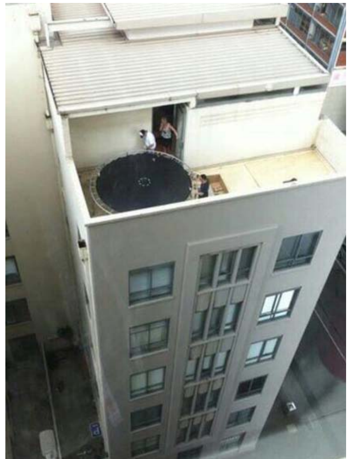
1st get the beer, then the trampoline...