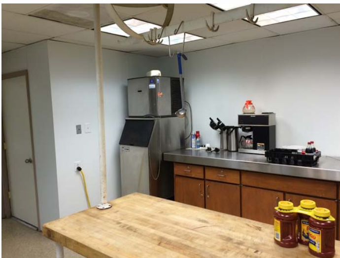
Behold the Kitchen!