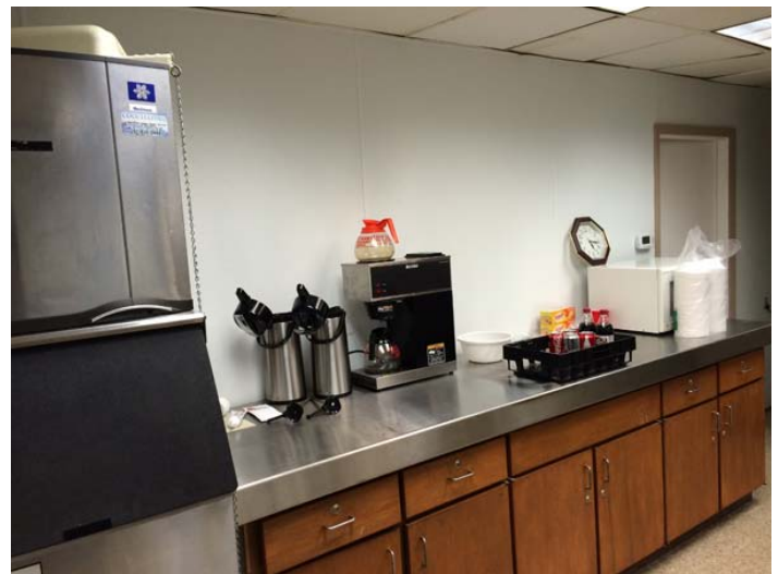
The Kitchen of Dreams