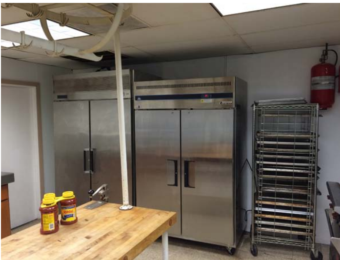
Our Awesome Kitchen

Keep up the good work gentlemen, we have a busy schedule coming up, stay in touch stay involved and let's make a difference.