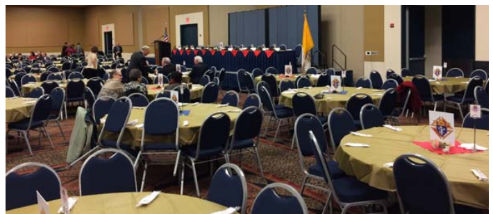
Empty Hall where the Clergy Appreciation Night Took Place

Daniel - 281-450-7534 4926 Fitzwater Spring TX 77373