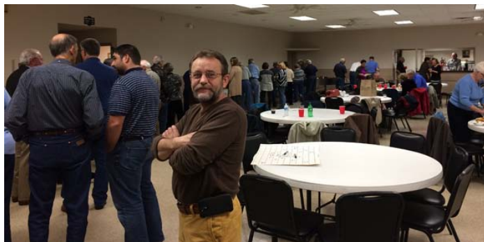
White Elephant Dinner